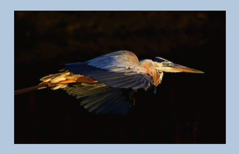
Twilight Great Blue Heron (30 x 50 inches, infused ink on metal) $5,580

Great Blue Heron flying through The Florida Everglades under a mangrove canopy in the early dawn of nautical twilight when the sun is 6 to 12 degrees below the horizon. With the rising sun throwing a beam of light on the marshy water below, the majestic heron flew right through the cast of light and the suns angle highlighted his head while the reflection illuminated parts of legs and feathers. A truly magical moment that I will never be able to duplicate in nature.