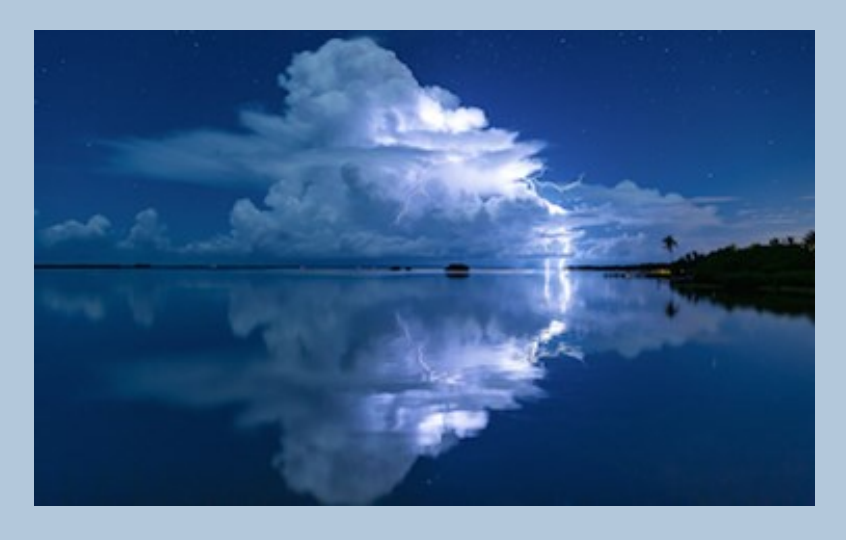
Light Show National Geographic Editor's Award Winning Photograph (30 x 50 inches) $5,850

One thing Florida is known for during the summer months is our thunderstorms. Full fledged, roaring, fast & furious, thunderhead, polarizing, electrifying, run-for-shelter storms. This photograph was taken at 4:30am on the small coastal island town of Pine Island in southwest Florida. It is one single thunderhead that formed in about 15 minutes and dissipated almost as quickly. Thunder can be heard from about 10 miles away. Lightning can strike outward by 10 miles. So if you hear thunder rumbling from the sky and clouds, you are in danger of being struck by lightning.