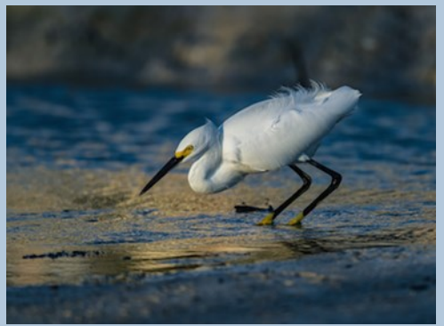
Pot O' Gold Snowy Egret (20 x 30 inches, infused in on metal) $2,575

Identifying the Snowy Egret can be a little confusing, and notably in Florida where there are several egret and heron species that look very similar, especially when they are gathered together in a marsh or river bed. The most distinctive feature that is a sure give-a-way to the identification of the Snowy Egret is its golden slippers. This beautiful, graceful small egret has white plumage, black legs and yellow feet that are even more brilliant during breeding season. Snowy Egrets were victims of the plume-hunting industry that took place in the mid to late 1800's. The work of concerned citizens was a triumph that helped the recovery of the shorebird population and give birth to the conservation movement. Todays threats to snowy egret populations are coastal development and habitat degradation.